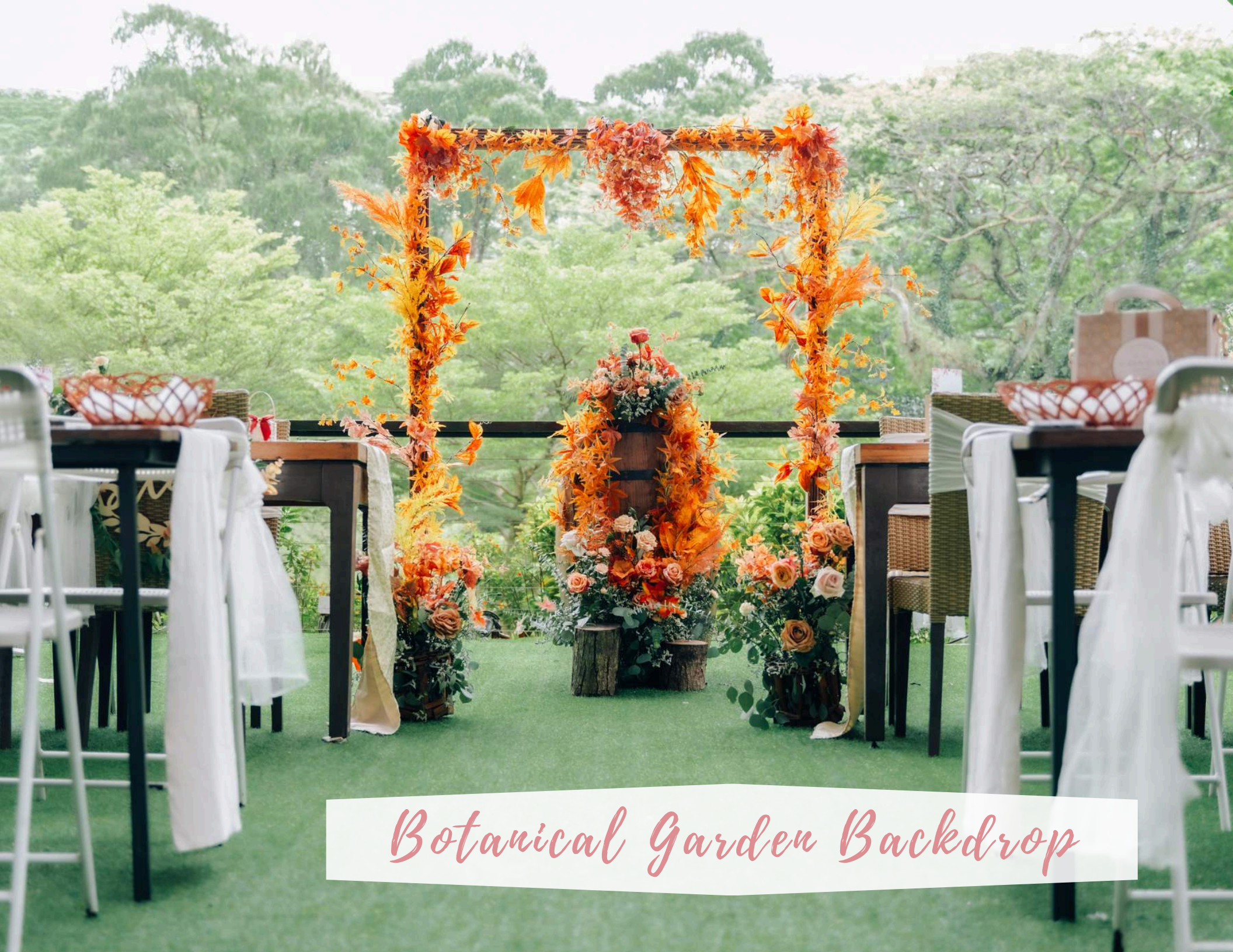
Botanical Garden Backdrop