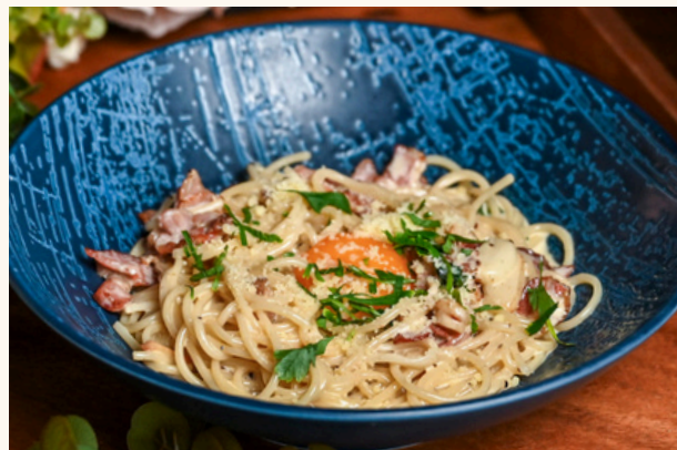
Spaghetti Carbonara $24 Bacon | Garlic | Cream | Egg yolk