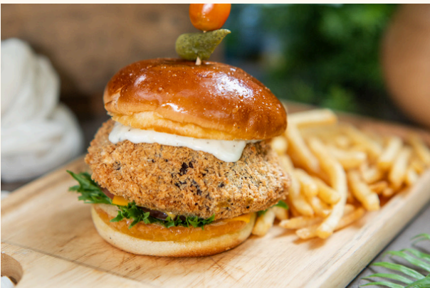
Portobello Mushroom Burger $27 Fried Portobello Mushroom Patty | Cheese | Lettuce | Served with Fries | Garlic Lemon Mayo