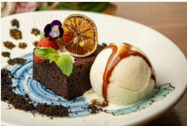
Spent Grain Brownie $16 Dark chocolate with spent grain from our brewery | Serve with ice cream and fruits