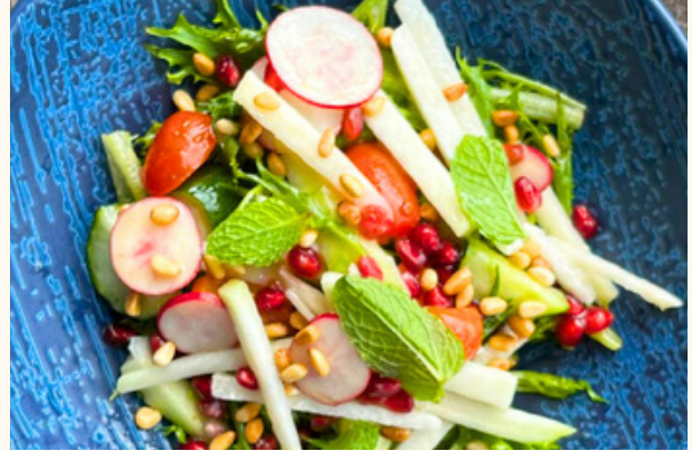
Reddot Guava Salad $16 Guava | Turnip | Cucumber | Pomegranate | Torched Ginger | Cherry tomato | Mint | Pine nuts | Lemon plum dressing