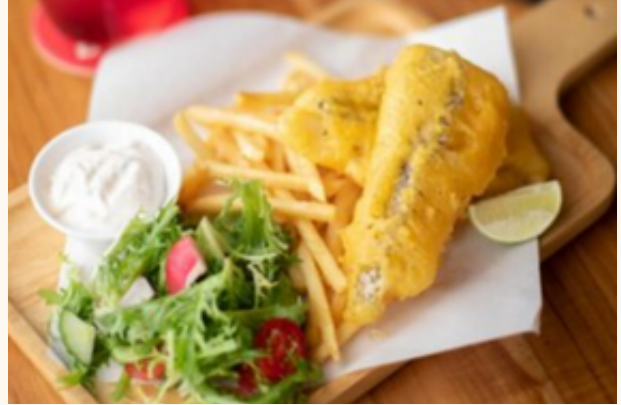
Reddot Fish & Chips $33 Marinated with Reddot beer | Green Salad | Fries