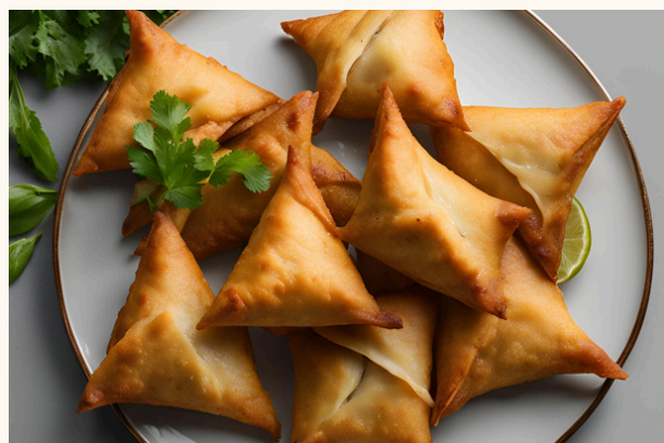
Samosa (Veg) $13 Potato | Onion | Garlic | Chili Powder | Curry Powder | Soy Oil