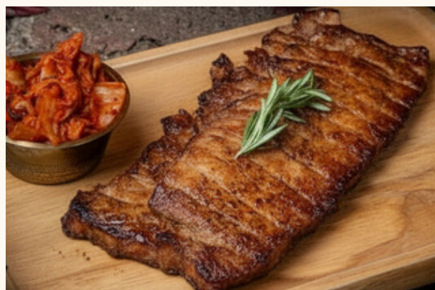
Grilled Porky with Kimchi $29 Pork Belly | Homemade Kimchi