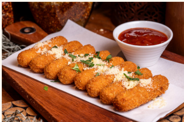
Cheese Sticks $16 Crispy, golden exterior with a warm, gooey cheese center. Contains 8 pieces.