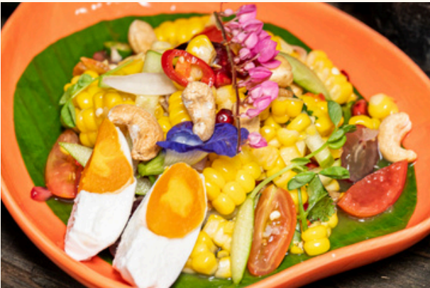
Thai Corn Salad $16 Corn | Apple | Grape | Onion | Carrot | Pomegranate | Cashews | Pine Nut | Cherry Tomatoes