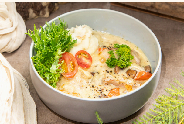
French Chicken Stew $24 Homemade Chicken Stew | Seasonal Vegetables | Mashed Potato | Salad