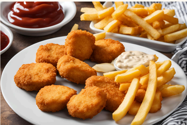
Crunch and Munch

Chicken Nuggets | French Fries | Kid Friendly