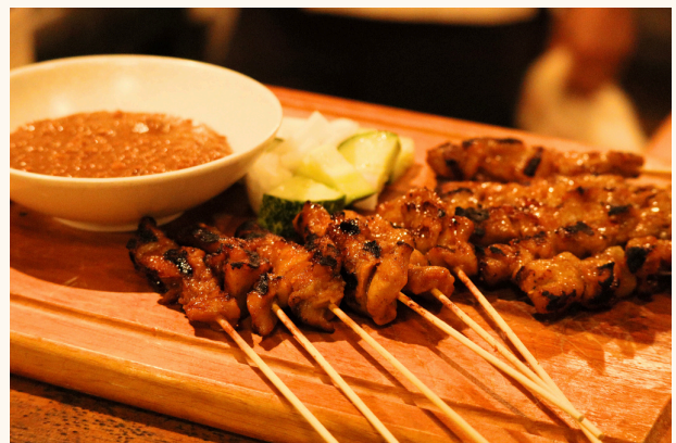
Satay - Chicken & Pork $29 6 Sticks Chicken | 6 Sticks Pork | Cucumber | Onion | Peanut & Pineapple Sauce