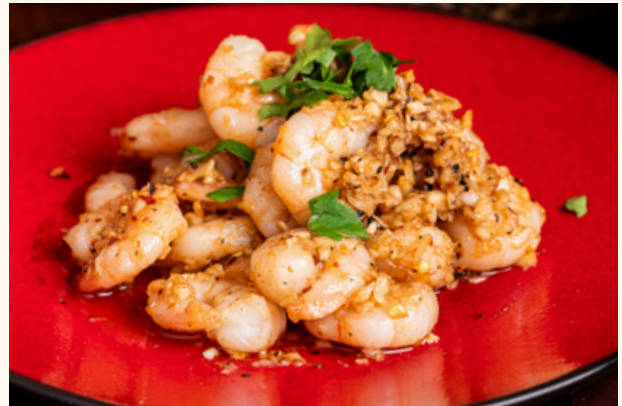
Gambas $16 Prawn | Garlic | Chilli