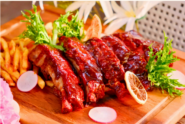
Smoked Pork Ribs $30 Slow cooked to perfection for 6 hours. Served with Fries