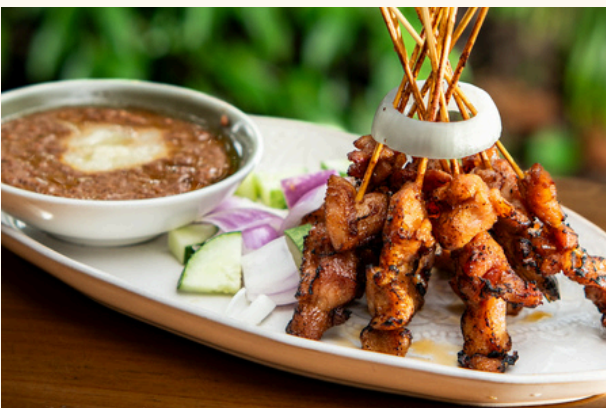
Satay - Pork $29 12 Sticks | Cucumber | Onion | Peanut & Pineapple Sauce