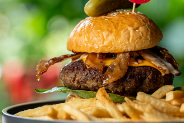
Reddot Burger $27 Ground beef | Bacon | Cheese | Lettuce | Tomato | Mayonnaise | Cheese sauce | Homemade special sauce