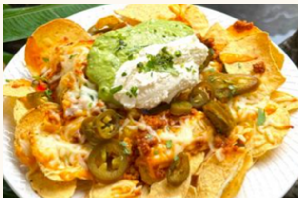
Nachos Supreme $19 Nachos | BBQ Minced Chicken | Cheese | Guacamole | Sour Cream | Jalapenos