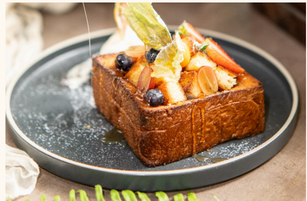
Shibuya Honey Toast $20 Soft Bread | Vanilla Ice Cream | Brown Butter | Syrup | Fruits