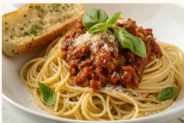
Bolognese Pasta $24 Homemade Bolognese Sauce | Minced Chicken | Spaghetti