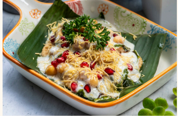
Papdi Chat (VEG)