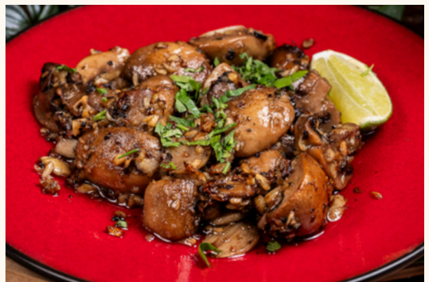
Garlic Mushroom $12 Button Mushroom | Garlic