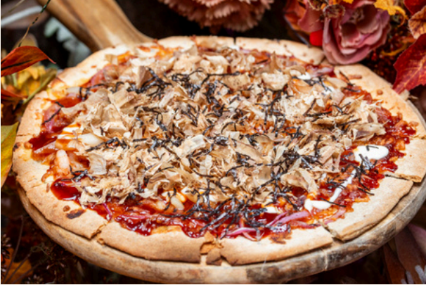
Okonomiyaki Seafood Pizza $29 Prawn | Squid | Bonito flakes | Onion | Shredded nori | Okonomiyaki sauce