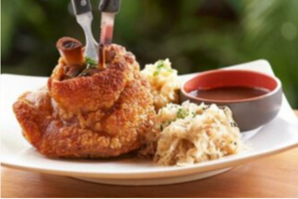
Pork Knuckle $42 Serves 2-4 pax | Marinated with RedDot beer | Crushed potatoes | Sauerkraut | Chicken jus