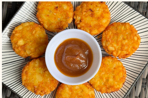
Mini Potato Rosti $14.5 A crispy mini potato rosti with creamy mayo