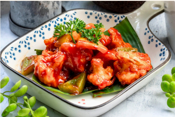
Gobi Manchurian (VEG)

Flour cracker | Chickpeas | Yoghurt | Potato | Pomegranate | Red onion | Chaat masala | Tamarind | Green chutney | Spices