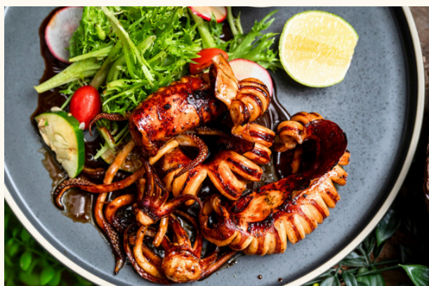
BBQ Squid Tubes $30 Served with a tamarind chilli sauce