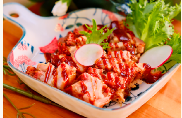
Smoked Pork Belly $28 Slow cooked to melt in your mouth