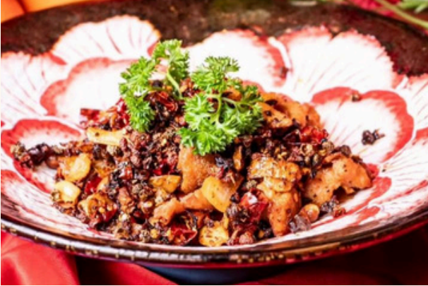
Sizzling Chicken $15 Chicken | Chilli | Szechuan Pepper | Peanuts