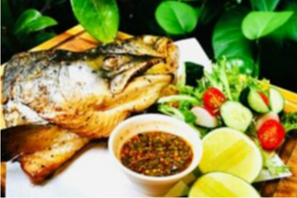
Grilled Salmon Head $22 Kindly check with server for availability