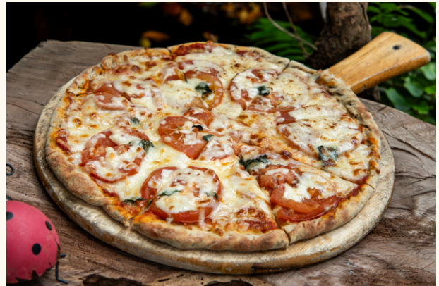
Margherita Pizza $26 Tomato | Sweet basil | Mozzarella