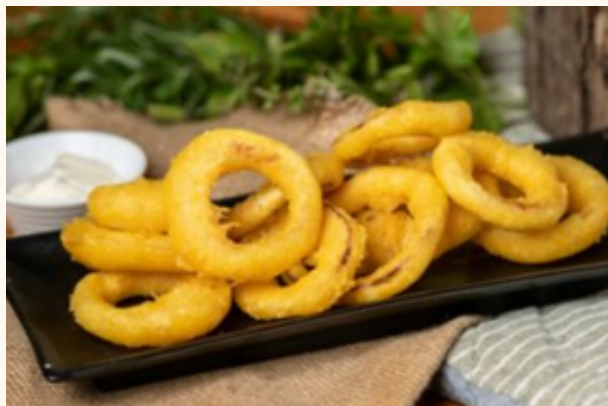
Onion Rings $12 Reddot beer battered