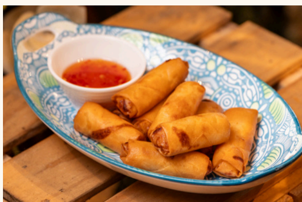
Spring Rolls (Veg) $13 Crispy, delicate wrappers filled with fresh, flavorful vegetables