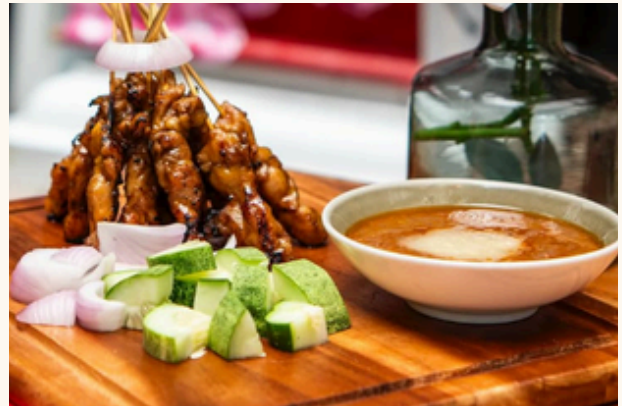
Satay - Chicken $29 12 Sticks | Cucumber | Onion | Peanut & Pineapple Sauce