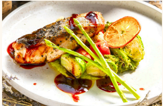
Pan-Seared Salmon Fillet $33 Green pea purée | Sautéed seasonal vegetable | Unagi sauce