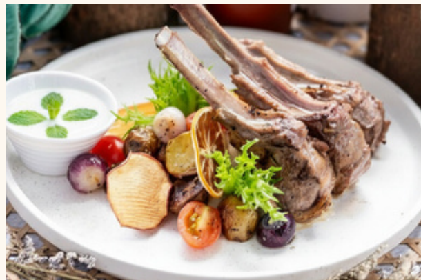
Lamb Rack (3 pieces) $49.90 Served with a yoghurt mint sauce on a bed of smoked russet potatoes