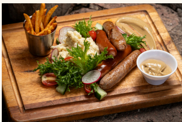
Sausage Platter $40 Smoked Chicken & Chicken Cheese Sausages served with Dijon mustard