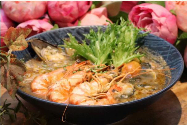
Fisherman Stew $28 Prawns | Scallop | Mussels | Clams | Seasonal Vegetable | Orzo Pasta