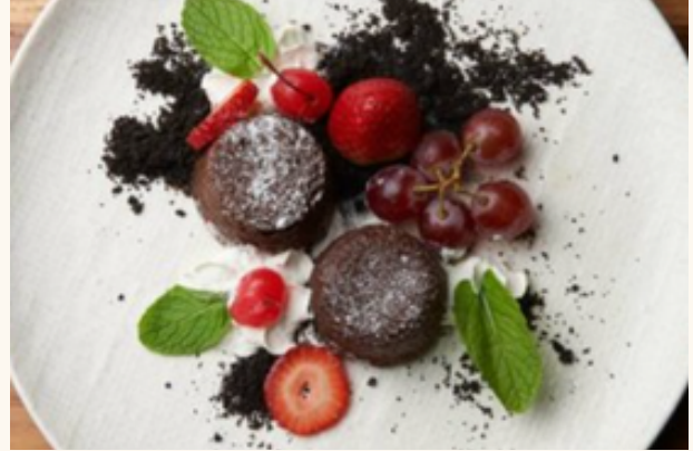
Reddot Chocolate Melt Cake $18 Chocolate lava cake | Fruit | Served with ice cream and fruits