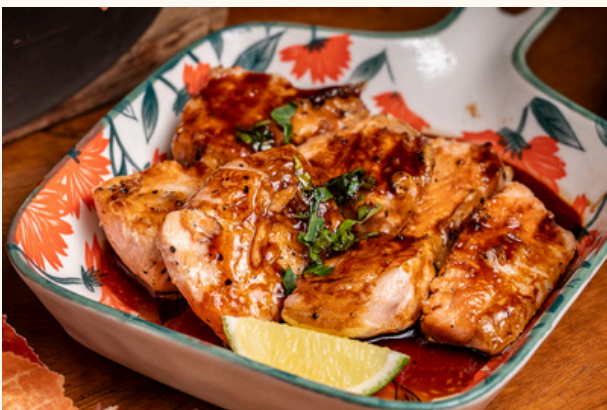
Salmon Belly $18 Teriyaki Sauce coated Salmon Belly