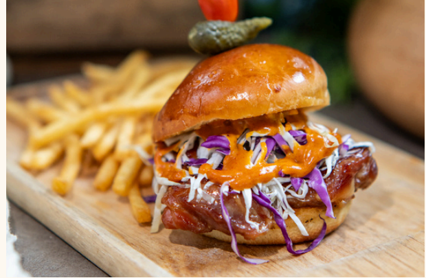
Reddot Honey Chicken Burger $25 Breaded chicken thigh | Cabbage | Tomato | Homemade special sauce | Served with Fries