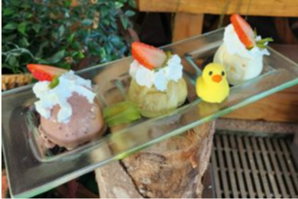
Triple Scoop Ice Cream $15 Vanilla Ice-cream | Chocolate Ice-cream | Lemon Sherbet | Marshmallow