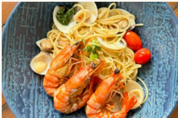
Spaghetti Seafood Aglio Olio $28 Squid | Clam | Prawn | Basil | Chilli | Garlic | Wine broth