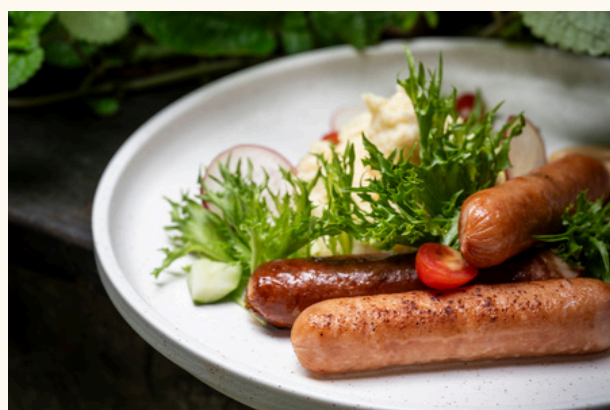
Chicken Cheese Sausage $26 Chicken | Cheese | Dijon Mustard