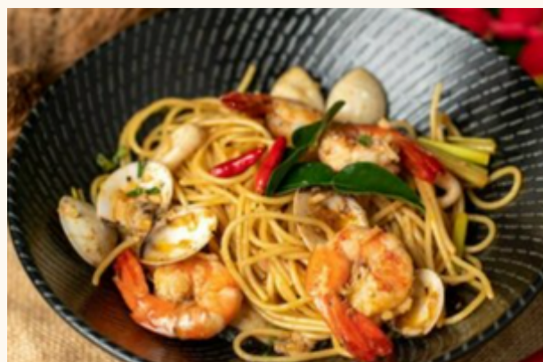
Spicy Thai Seafood Pasta $28 Crab meat | Bell peppers | Basil | Chilli | Garlic | Wine broth