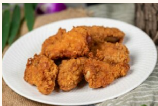
Spicy Wings & Drumlets $18 7 Pieces of crispy, delicious wings & drumlets