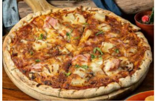
Hawaiian Pizza $27 Good for sharing! Can approach service staff for a vegetarian option. Gammon ham | Pineapple | Mushroom