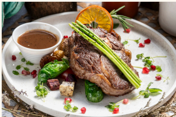
Rib-eye Steak (250gm) $45 Served with a black pepper sauce, on a bed of smoked russet potatoes