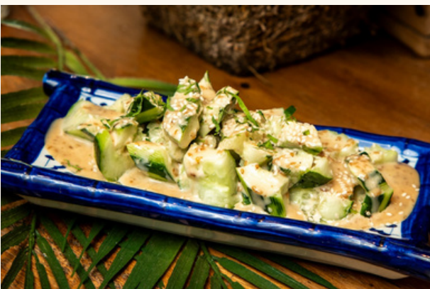
Japanese Cucumber Salad (VEG)