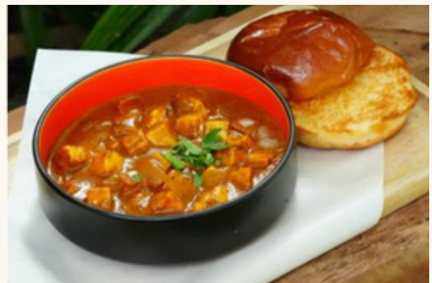
Chef's Cottage Cheese