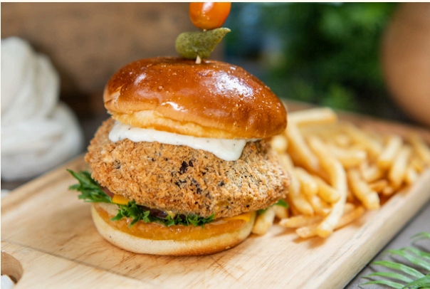
Portobello Mushroom Burger $27 Fried Portobello Mushroom Patty | Cheese | Lettuce | Served with Fries | Garlic Lemon Mayo