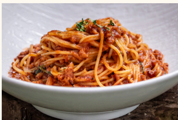
Bolognese Pasta $24 Homemade Bolognese Sauce | Minced Chicken | Spaghetti