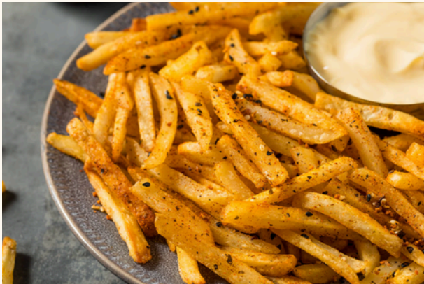
French Fries (Plain)