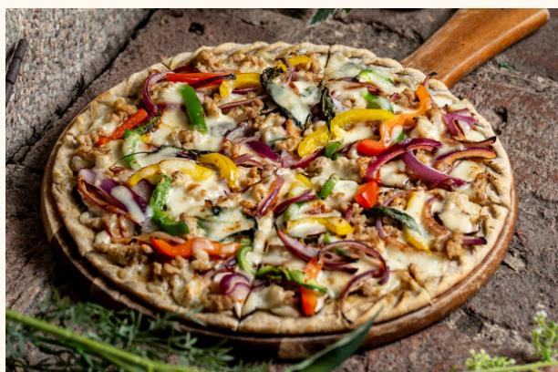
OMG Spicy Chicken Pizza $27 Chicken | Homemade Green Curry Paste | Mozzarella Cheese | Onion | Capsicum |