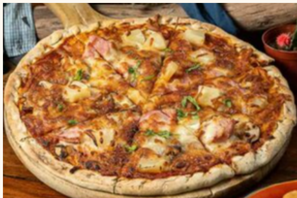
Hawaiian Pizza $27 Good for sharing! Can approach service staff for a vegetarian option. Gammon ham | Pineapple | Mushroom