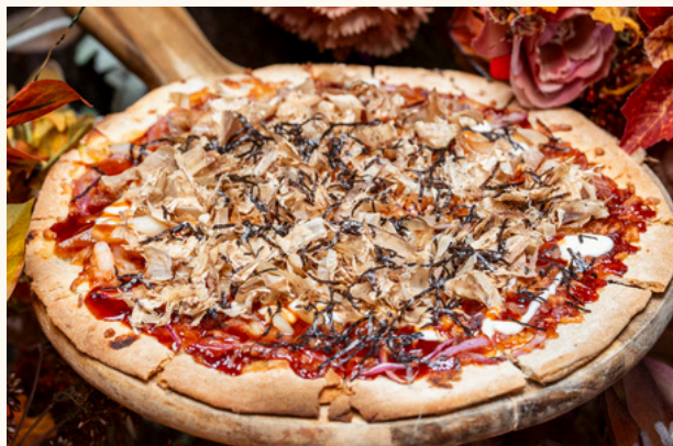
Okonomiyaki Seafood Pizza $29 Prawn | Squid | Bonito flakes | Onion | Shredded nori | Okonomiyaki sauce