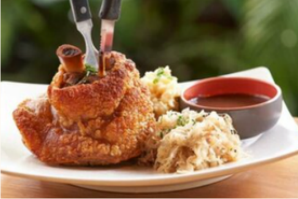
Pork Knuckle $42 Serves 2-4 pax | Marinated with RedDot beer | Crushed potatoes | Sauerkraut | Chicken jus