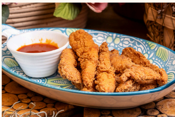
Chicken Tenders $16 Boneless strips of crispy chicken tenders