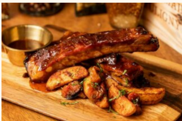
Smoked Pork Ribs