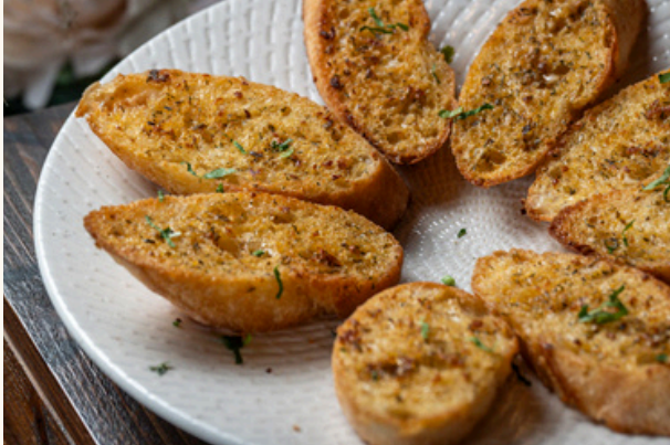
Lemongrass Chicken Bites $18

Chicken | Lemongrass | Garlic | Homemade Thai spicy sauce