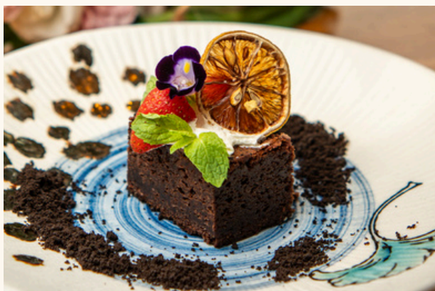
Spent Grain Brownie

Chocolate lava cake | Fruit | Served with ice cream and fruits