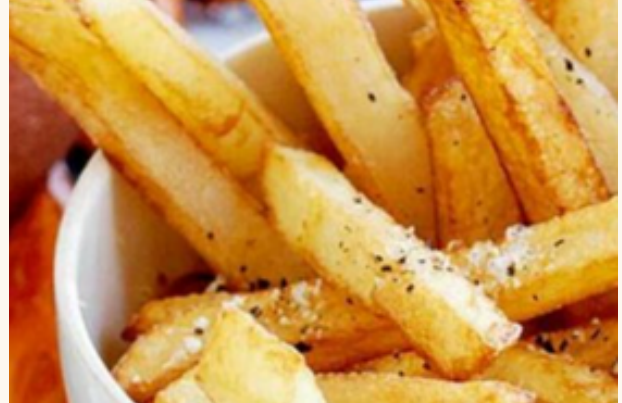
Chicken Wings with Thai Chilli Sauce $16

Chicken | Lemongrass | Garlic | Homemade Thai spicy sauce