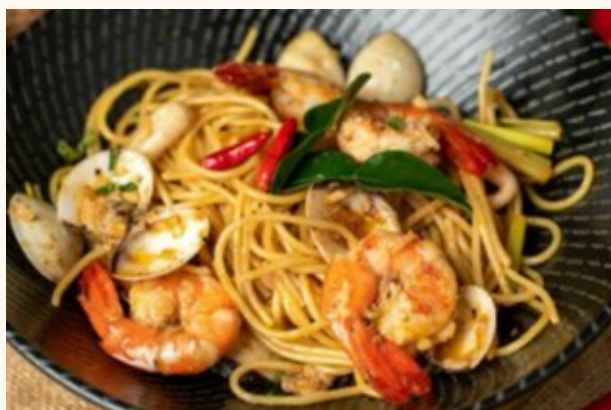
Tom Yum Seafood Pasta $28 Squid | Clam | Prawn | Lemongrass | Kaffir lime | Chilli | Tom yum