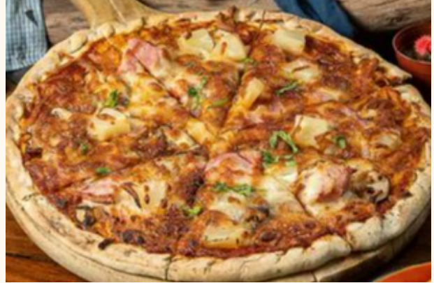
Hawaiian Pizza $27 Good for sharing! Can approach service staff for a vegetarian option. Gammon ham | Pineapple | Mushroom