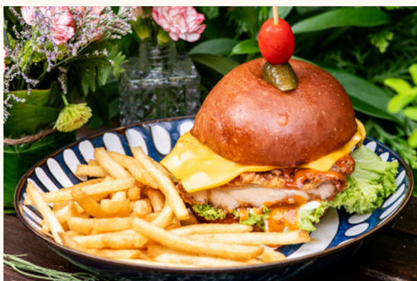
Reddot Chicken Burger

IMPOSSIBLE Beef (Plant-based protein) | Cheese | Lettuce | Tomato | Mayonnaise | Cheese sauce | Goma sauce