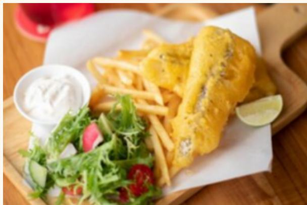
Reddot Fish & Chips

Serves 2-4 pax | Marinated with RedDot beer | Crushed potatoes | Sauerkraut | Chicken jus