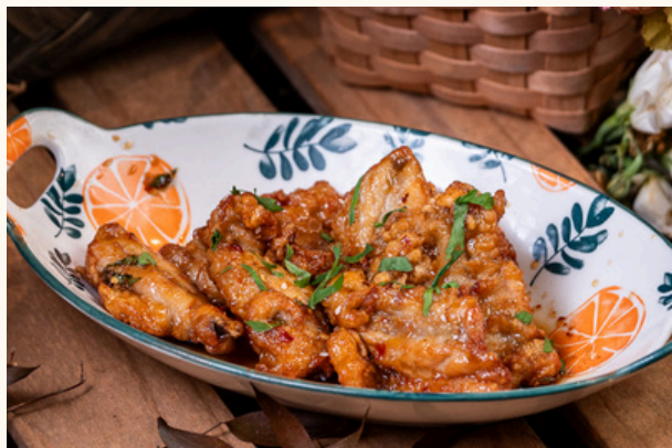
Chicken Wings with Thai Chilli Sauce $16 Thai-style chicken ribs: tender, juicy, infused with a tangy, spicy sauce. CONTAINS BONES.