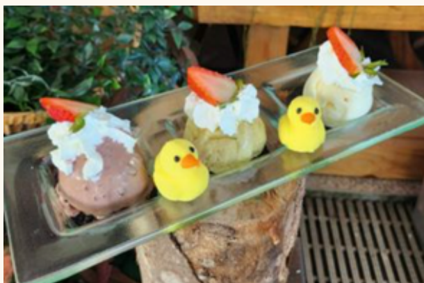
Triple Scoop Ice Cream