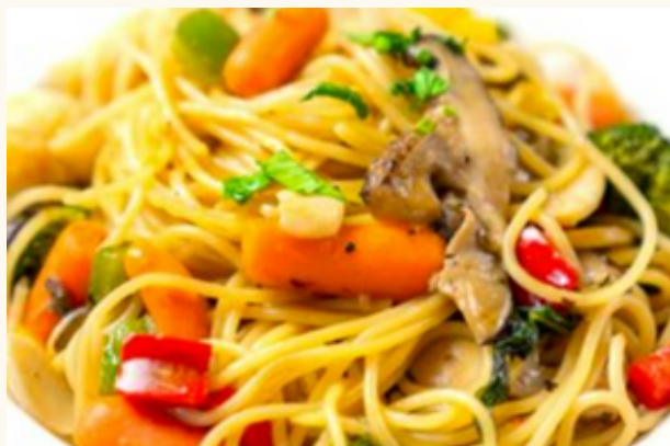
Vegetariano $23 Seasonal vegetables | Garlic | Wine broth | Chilli padi