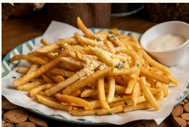
Truffle Fries $17 Truffle Oil | Parmesan Cheese