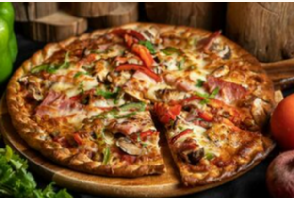
Latino Pizza $26 Seasonal vegetables | Garlic | Wine broth | Chilli padi