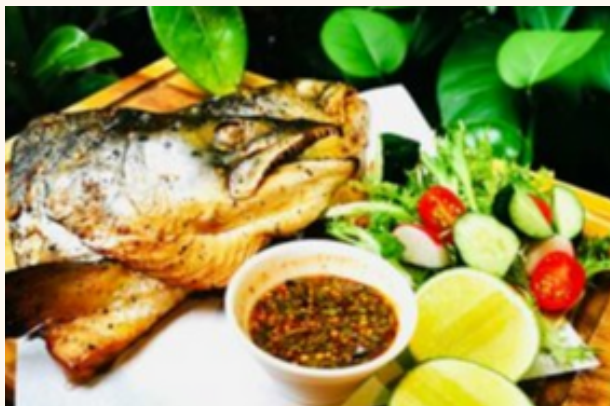
Grilled Salmon Head