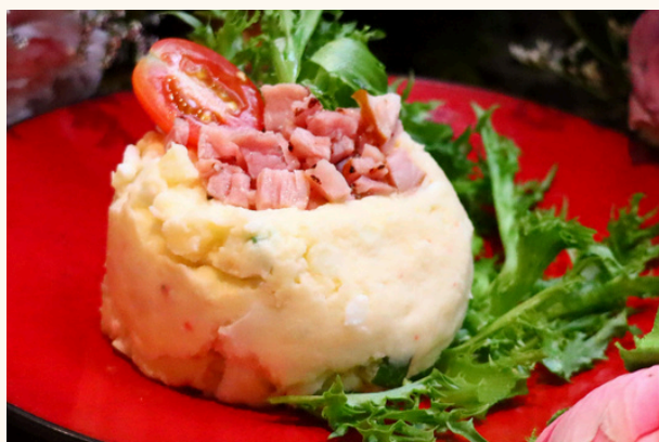
Japanese Potato Salad