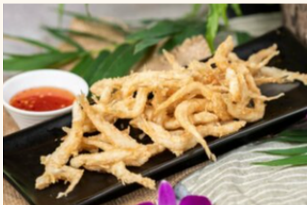
Silver Fish $16 Reddot beer-battered