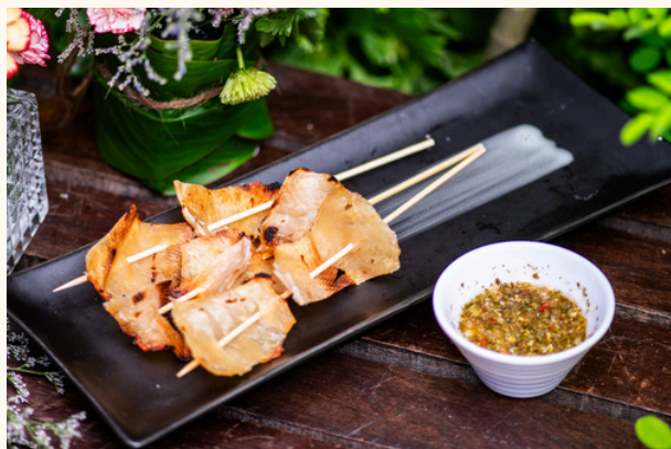
Grilled Dried Eihire Fin