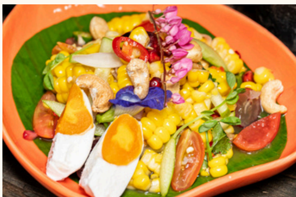
Thai Corn Salad

Guava | Turnip | Cucumber | Pomegranate | Torched Ginger | Cherry tomato | Mint | Pine nuts | Lemon plum dressing