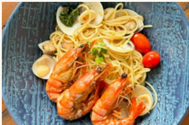
Spaghetti Seafood Aglio Olio $28 Squid | Clam | Prawn | Basil | Chilli | Garlic | Beer broth