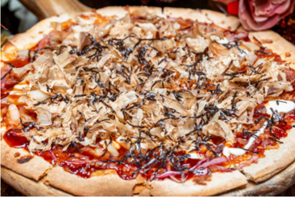
Okonomiyaki Seafood Pizza $29 Prawn | Squid | Bonito flakes | Onion | Shredded nori | Okonomiyaki sauce