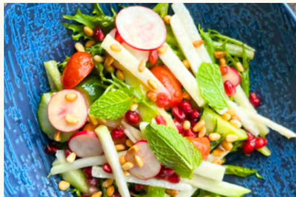
Reddot Guava Salad

Chicken | Chilli | Szechuan Pepper | Peanuts