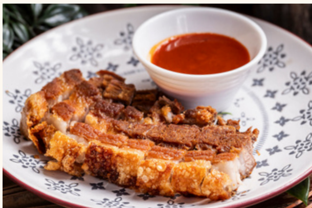
Crispy Pork Belly $18 Home-cured | Thai Lemongrass Chilli sauce