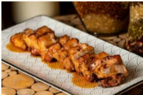
Smoked Pork Belly

Kindly check with server for availability