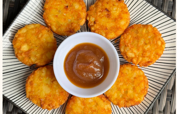
Mini Potato Rosti

Crispy, golden exterior with a warm, gooey cheese center. Contains 8 pieces.