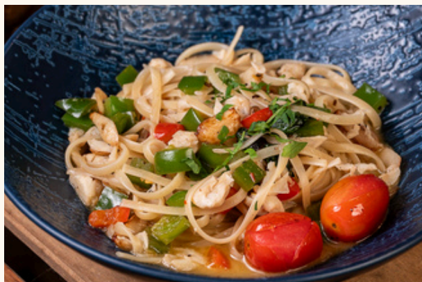
Reddot Spicy Crabmeat Linguini $30 Crab meat | Bell peppers | Basil | Chilli | Garlic | Wine broth