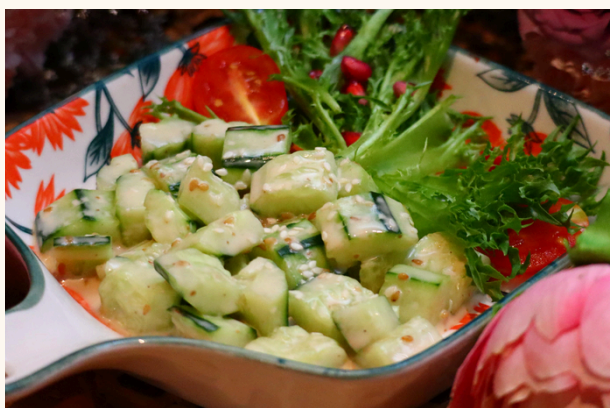
Japanese Cucumber Salad