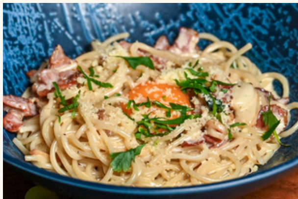
Spaghetti Carbonara $24 Bacon | Garlic | Cream | Egg yolk