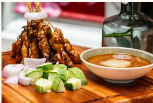
Satay - Chicken