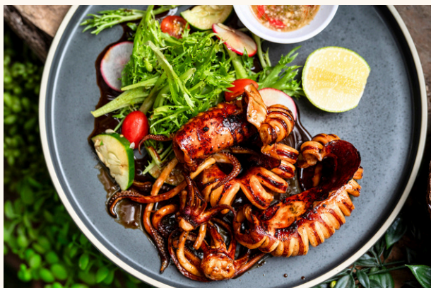
BBQ Squid Tubes

Served with a yoghurt mint sauce on a bed of smoked russet potatoes