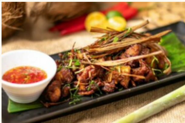
Lemongrass Chicken Bites $18 Chicken | Lemongrass | Garlic | Homemade Thai spicy sauce