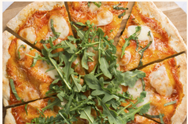
Margherita Pizza $26 Tomato | Sweet basil | Mozzarella